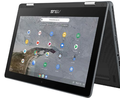
ASUS C203 11.6" Clamshell Chromebook – 4GB / 32GB

https://www.bestbuy.com/site/asus-flip-c214ma-2-in-1-11-6-touch-screen-chromebook-intel-celeron-4gb-memory-32gb-emmc-flash-memory-dark-gray/6333712.p?skuld=6333712